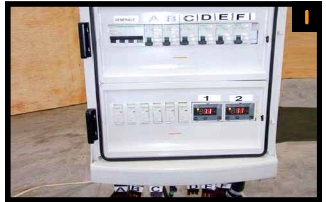
I. Connect the power cords and probe cords to the appropriate circuits on the electric board