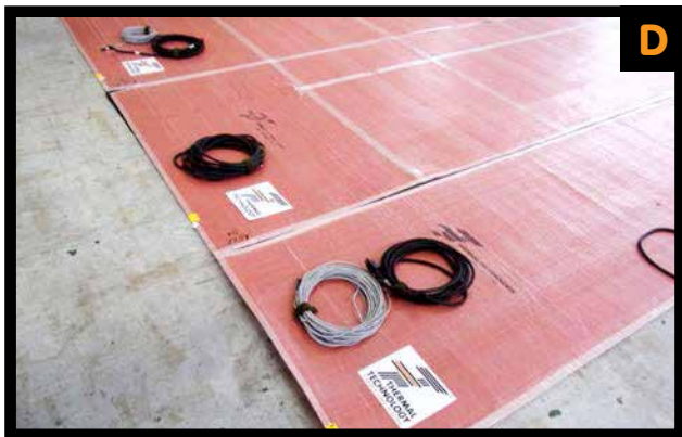
D. Place the power extension cords the way it is indicated in the diagram.