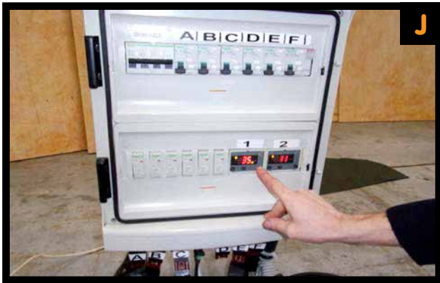
J. Adjust the desired temperature.