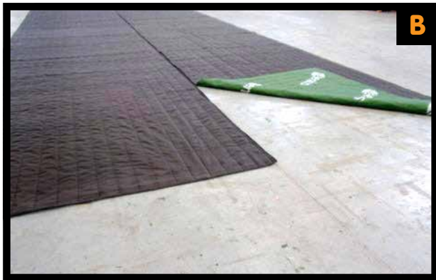
B. At the beginning lay down the elements for thermal insulation and floor protection, make sure the installation surface is flat and clean. The elements must be laid side by side, they must not overlap and/or fold upon each other, the elements must not be larger than the surface to be heated.