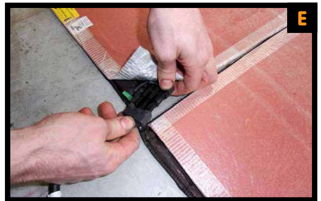
E. Connect each heating element with appropriate power cord. Connect the temperature probe extension cord, where indicated.