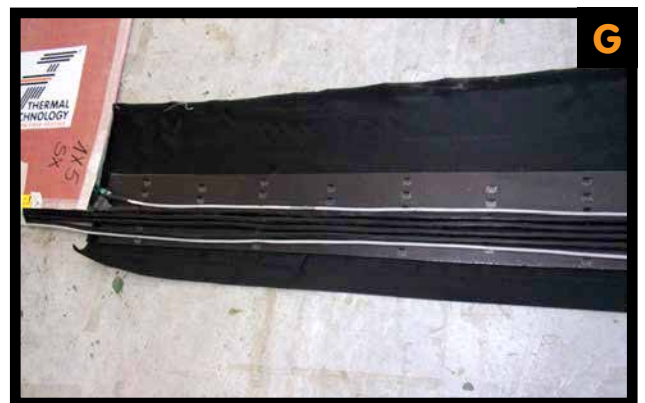
G. The cables must be grouped in the point indicated on the project, and an appropriate protection duct must cover them until electric board.