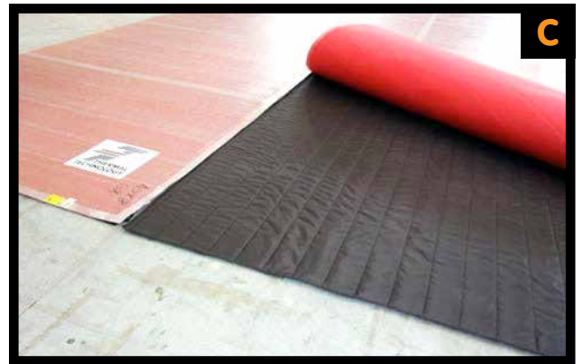
C. Place the heating elements over the thermal insulation.