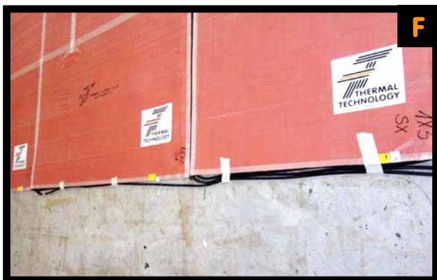
F. Pass the cords under the element's boards, or between two elements, where possible.