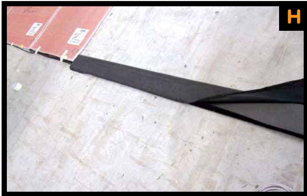
H. Close the duct using the lid and wrap it using the elastic and anti-slippery material, both provided.