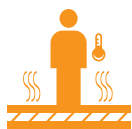
Adequate for installation under floor

The manufacturer declines all responsibility in case of improper use.