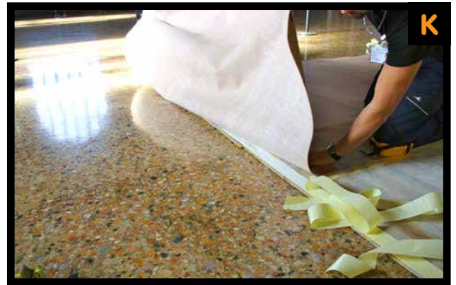
K. Once verified the functioning of all the elements, place the moquettes using common bi adhesive band.