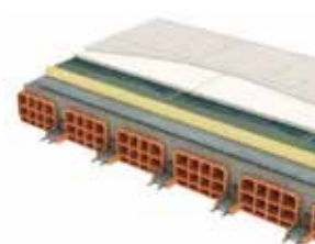
PANEL UNDER GYPSUM FIBER DRY SCREED PANELS