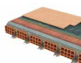
PANEL BETWEEN OLD AND NEW FLOOR