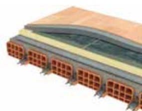
PANEL UNDER CONCRETE SCREED