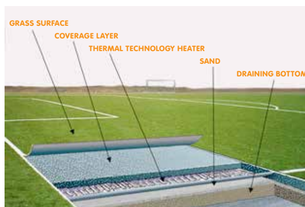
STRATIGRAPHY OF A HEATED FIELD