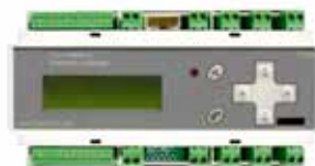
ELECTRONIC CONTROLLER T705