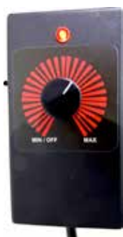
POWER DIMMER CODE T757.A