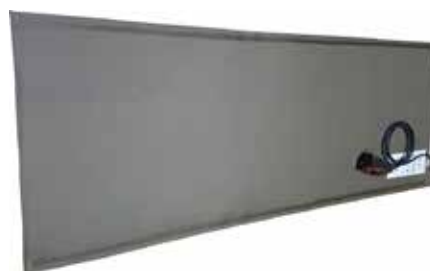
CARPET- LOWER SIDE (WITH INTENSITY DIMMER T757.A)