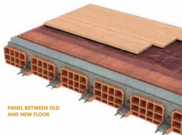
PANEL BETWEEN OLD AND NEW FLOOR